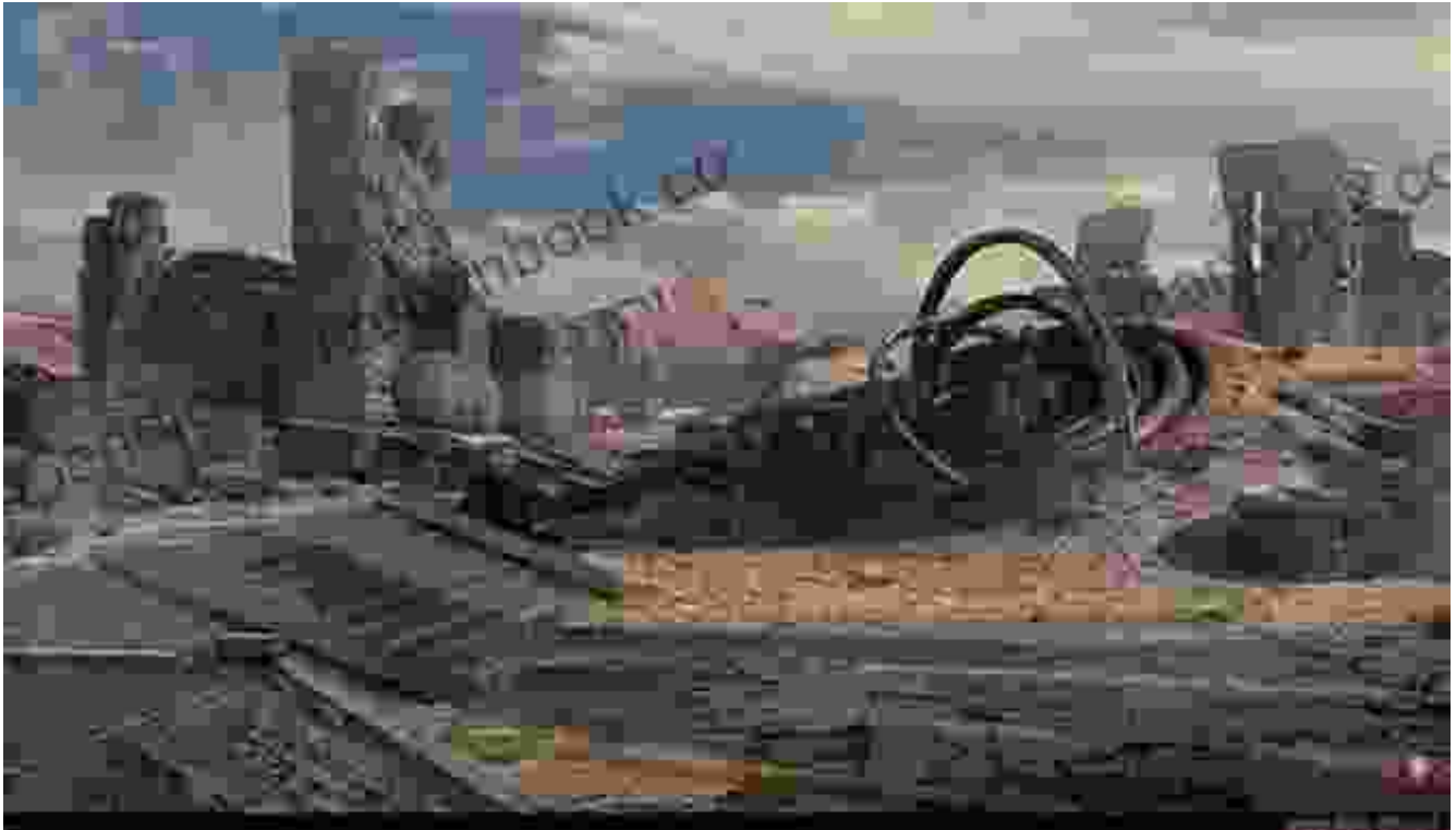
Cover illustration for "At the Mountains of Madness"

"At the Mountains of Madness" is a sprawling tale of scientific exploration and cosmic terror. A team of researchers ventures into the frozen wastes of Antarctica, where they discover a hidden city filled with ancient, alien ruins. As they delve deeper into the city, they encounter a terrifying race of creatures known as the Elder Things and learn of the dark history that connects humanity to these extraterrestrial beings.