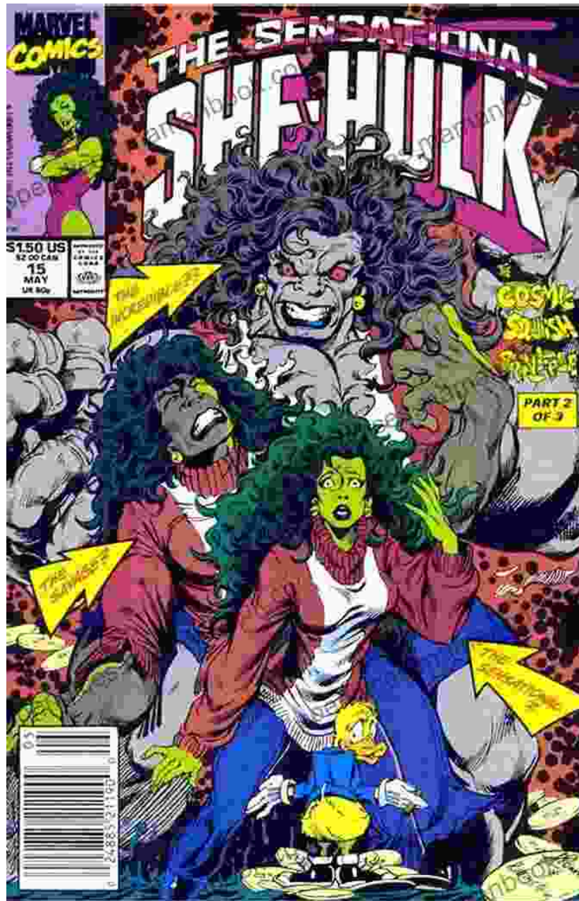
Cover art by John Byrne